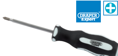
2 996CS/PT 'POUND THRU' CROSS SLOT SOFT GRIP SCREWDRIVERS

Expert Quality , screwdrivers with hardened SVCN+ satin chrome plated hexagonal blades. Attached to a soft grip, oil and solvent resistant handle with integrated toughened 'Pound Thru' metal cap designed for receiving hammer blows. Display packed.