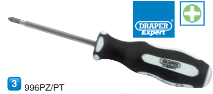
3 996PZ/PT 'POUND THRU' PZ TYPE SOFT GRIP SCREWDRIVERS

PZ TYPE products are compatible with *Pozidriv®/Supadriv® fixing systems