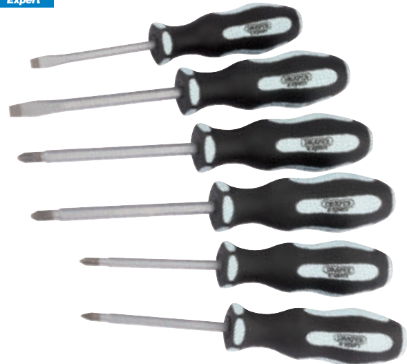
4 996/PT 'POUND THRU' SOFT GRIP SCREWDRIVER SET (6 PIECE)

Expert Quality , screwdrivers with hardened SVCN+ satin chrome plated hexagonal blades. Attached to a soft grip, oil and solvent resistant handle with integrated toughened 'Pound Thru' metal cap designed for receiving hammer blows. Supplied in a PVC storage case. Display packed.