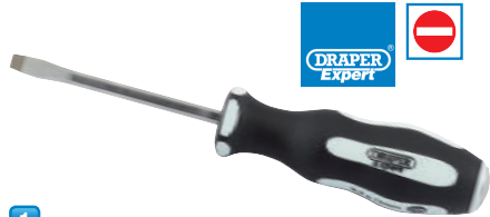
1 996/PT 'POUND THRU' PLAIN SLOT SOFT GRIP SCREWDRIVERS

Expert Quality , screwdrivers with hardened SVCN satin chrome plated hexagonal blades. Attached to a soft grip, oil and solvent resistant handle with integrated toughened 'Pound Thru' metal cap designed for receiving hammer blows. Display packed.