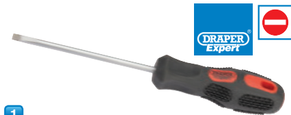
1 970P GENERAL PURPOSE PLAIN SLOT PARALLEL TIP SCREWDRIVERS (DISPLAY PACKED)

Expert Quality , screwdrivers with hardened SVCM satin chrome plated blades and sand blasted tips. The handle is manufactured from vulcanized 'soft grip' polymer which is colour coded for easy recognition.