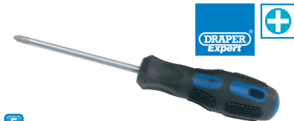
5 970CS GENERAL PURPOSE CROSS SLOT SCREWDRIVERS (DISPLAY PACKED)

Expert Quality , screwdrivers with hardened SVCM satin chrome plated blades and sand blasted tips. The handle is manufactured from vulcanized 'soft grip' polymer which is colour coded for easy recognition.