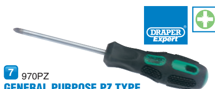
7 970PZ GENERAL PURPOSE PZ TYPE SCREWDRIVERS (DISPLAY PACKED)

PZ TYPE products are compatible with *Pozidriv®/Supadriv® fixing systems