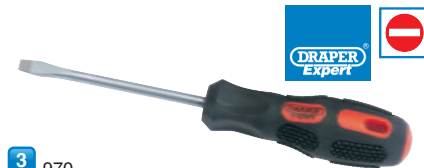
3 970 GENERAL PURPOSE PLAIN SLOT FLARED TIP SCREWDRIVERS (DISPLAY PACKED)

Expert Quality , screwdrivers with hardened SVCM satin chrome plated blades and sand blasted tips. The handle is manufactured from vulcanized 'soft grip' polymer which is colour coded for easy recognition.