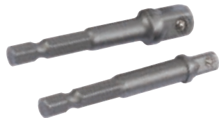
10 BCS SOCKET DRIVE ADAPTOR SET

Designed for use in conjunction with any 1/4" hexagon drive unit, i.e. hand, electric or air screwdrivers, to drive 1/4" and 3/8" square drive sockets. Comprises 1/4" hexagon x 1/4" square and 1/4" hexagon x 3/8" square adaptors. Manufactured from chrome vanadium steel hardened, tempered and chrome plated. Each square driver end incorporates a spring-loaded retaining ball for secure socket holding. Display packed.