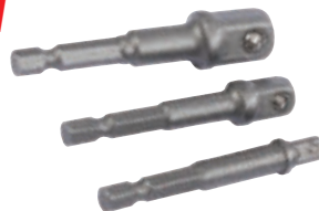
11 BCS/3 SOCKET DRIVE ADAPTOR SET

Designed for use in conjunction with any 1/4" hexagon drive unit, i.e. hand, electric or air screwdrivers, to drive 1/4", 3/8" and 1/2" square drive sockets. Comprises 1/4" hexagon x 1/4" square, 1/4" hexagon x 3/8" square and a 1/4" hex x 1/2" square adaptors. Manufactured from chrome vanadium steel hardened, tempered and chrome plated. Each square driver end incorporates a spring-loaded retaining ball for secure socket holding. Display packed.