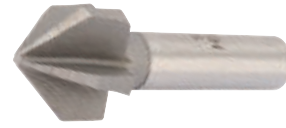
3 HSS ROSE COUNTERSINK BITS

Heavy duty countersink bit, made from high speed steel hardened and tempered to 55HRC for longer life. The 90° head incorporates five cutting edges and an 8mm diameter shank. Suitable for use with hand or power drills on hard or softwood, metals and plastics.