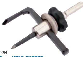
2 4302B 40-120mm HOLE CUTTER

Combination shank for hand brace or power drill. Speed range 200 rpm when cutting holes above 90mm diameter increasing to 800rpm for 40mm diameter holes. The cutter has an easy to use adjustment nut, graduated beam and hardened pilot point. For wood and plastics, maximum cutting depth 30mm. Display packed.