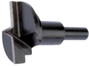
1 4766 35mm HINGE HOLE CUTTER

Manufactured from hardened and tempered tool steel. Display packed.