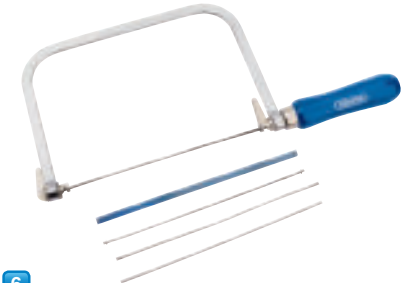
6 8904 COPING SAW WITH SPARE BLADES

Chrome plated frame with wooden handle and Supplied with five assorted blades. Blade can be turned through 360° for intricate work. Display packed.