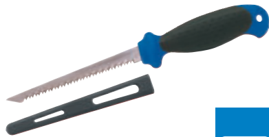
2 1192 150mm SOFT GRIP HARDPOINT PLASTERBOARD SAW

Expert Quality , designed for cutting plasterboard, chipboard or hardboard. 2.4mm cross cut tapered blade with hardened teeth and soft grip two tone handle. Supplied with blade sheath. Display packed.