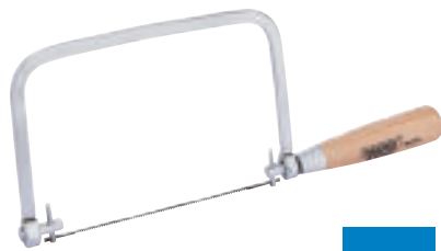
5 8901 COPING SAW

Expert Quality , chrome plated frame with wooden tensioning handle. Blade can be turned through 360° for intricate work. Display packed.