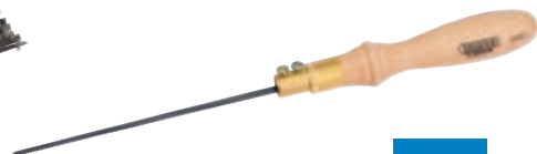
10 2023 275mm PAD SAW

Expert Quality , with a smoothly turned and polished beechwood handle with brass blade mount. Supplied with general purpose blade. Will also accommodate conventional hacksaw blades. Display packed.