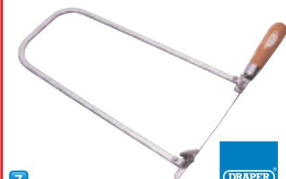
7 8905 FRETSAW

Expert Quality , plated frame with wooden handle and Supplied with 18tpi blade. Throat depth 295mm. Display packed.