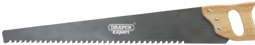
1 MS750 750mm MASONRY SAW

33 tungsten carbide tipped teeth for cutting soft bricks, Thermalite block, etc. High carbon steel non stick coated blade. Hardwood handle is securely fixed to blade and is designed to enhance user comfort and control. Sold loose.