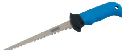
3 DWS150 150mm SOFT GRIP HARDPOINT PLASTERBOARD SAW

Designed for cutting plasterboard, chipboard or hardboard. Double bevel hardened teeth and soft grip handle for user comfort. Display packed.