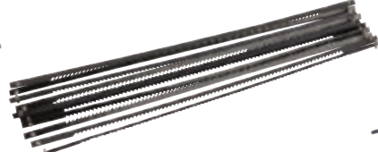
9 297/P 15tpi COPING SAW BLADES

Pinned end blades supplied on display cards of ten. For use with Stock No.18052 and 64408 Coping Saws and other manufacturers coping saws. Display packed.