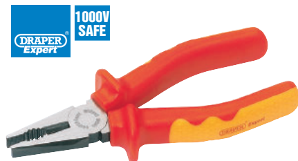
1 63AVDE VDE APPROVED FULLY INSULATED COMBINATION PLIERS

Slip guards prevent hands slipping onto live conductors Induction hardened cutting edges for the ultimate performance Lacquered and polished for rust protection Hardened and tempered chrome vanadium steel for strength and durability Top quality pivot precision machined for minimum play and smooth one handed operation Heavy duty comfortable handle for working long periods Ergonomical soft grip feature for comfort