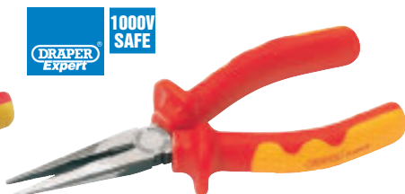
6 36AVDE VDE APPROVED FULLY INSULATED LONG NOSE PLIERS

Manufactured to DIN Standard and individually certified to EN 60900